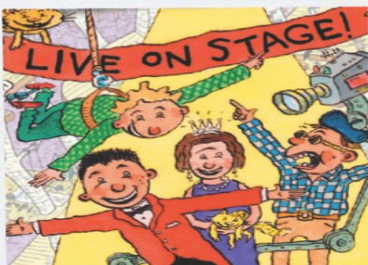
THE 78 STOREY TREEHOUSE 21 & 22 JUN