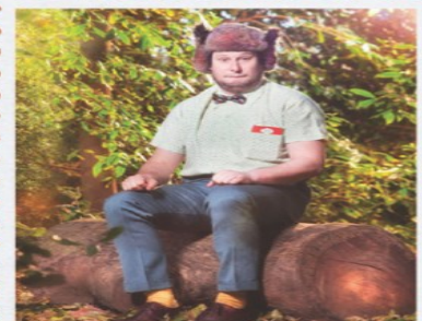
BIG BAD WOLF 25 & 26 OCT