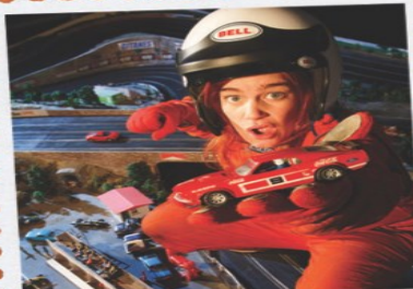
RED RACING HOOD 31 AUG & 1 SEP